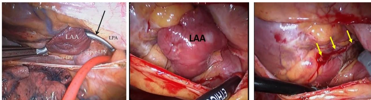
Thoracoscopic view of en bloc LPVs and LAA Isolation: LAA = left atrial appendage; LPV, A = left pulmonary vein, artery; I = Clamp Isolator

Technologies used for WOP: Atricure Clamp (and Pen) for the epicardial ablations and Ethicon cut-and-staple instrument for the LAA resection.